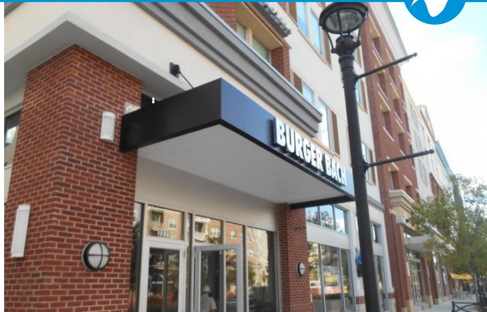
NEW ACM CANOPY WITH REVERSE CHANNEL LETTERS