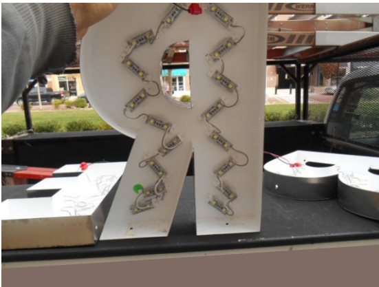
LED MODULES ATTACHED TO BACK SIDES OF LETTER FACES PRODUCE HALO LIGHTING AROUND EACH LETTER FOR AN INTERESTING NIGHT-TIME EFFECT.

Back-lit letters are produced by custom forming letters to match a company's logo style and are lit from behind. There are many materials available for the letters depending on the exact look the customer wants to project about its brand. The lighting is produced with LED modules that are fastened to the backs of the letters. Light is bounced off the wall behind the letters to produce a neat halo effect around the letters.