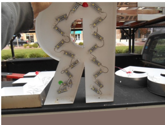
LED MODULES ATTACHED TO BACK SIDES OF LETTER FACES PRODUCE HALO LIGHTING AROUND EACH LETTER FOR AN INTERESTING NIGHT-TIME EFFECT.