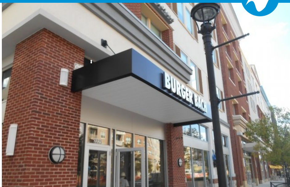
NEW ACM CANOPY WITH REVERSE CHANNEL LETTERS

Back-lit letters are produced by custom forming letters to match a company's logo style and are lit from behind. There are many materials available for the letters depending on the exact look the customer wants to project about its brand. The lighting is produced with LED modules that are fastened to the backs of the letters. Light is bounced off the wall behind the letters to produce a neat halo effect around the letters.